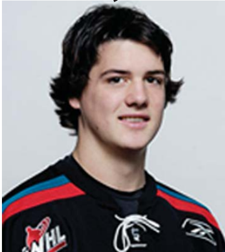
Jamie Benn-RW Kelowna Rockets (WHL)

Jamie Benn is a what you call a pure goal scorer. Playing his minor hockey for the Peninsula Eagles, Jamie signed with the Junior "A" Victoria Salsa at the age of 17. Benn was named the BCHL rookie of the year for the 2006/07 season. Last summer Jamie was drafted by the Dallas Stars of the National Hockey League and turned some heads at the teams rookie camp. Benn is currently playing for the Kelowna Rockets of the Western Hockey League where he leads the team in scoring with 33 goals and 32 assists in 62 games.